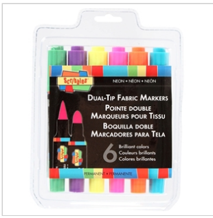
Dual Tip Neon 6 Pack (24249)